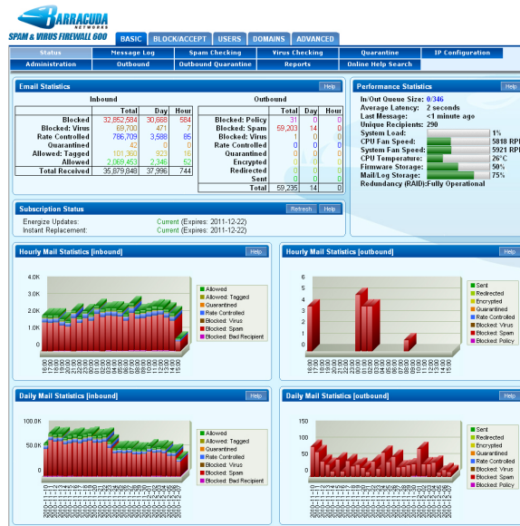
The Barracuda Spam & Virus Firewall filters all email messages and displays the number of emails received with statistics on how they were processed.

The Barracuda Spam & Virus Firewall is easy to set up with no software to install or network modifications required – minimizing ongoing administration. Energize Updates are delivered automatically by Barracuda Central, an advanced technology center where engineers work relentlessly to provide the latest spam definitions, virus definitions, and security updates which are distributed hourly for continuous protection against the latest threats.